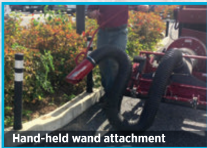
Hand-held wand attachment